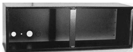
DHB - DUAL HOUSING BOX