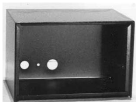
SHB - SINGLE HOUSING BOX

Note: pump plug outlets can be repositioned on request.