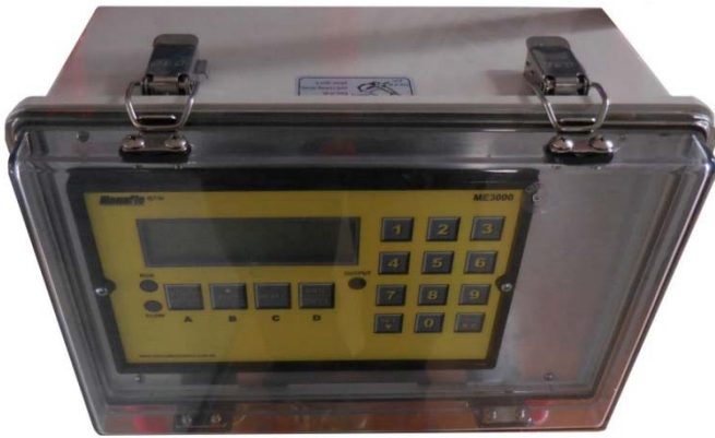
HB2510, shown with ME3000 Batch Controller, has downward opening transparent cover.