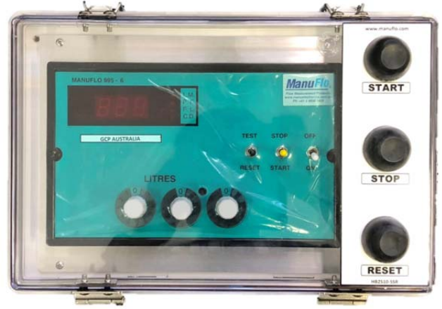
HB2510-SSR shown with ME995-6 Batch Controller, has Start / Stop / Reset external commands buttons.

The HB2510 IP65-rated waterproof enclosures are ideal for housing ME995 / ME3000 / ME999 Batch Controllers when used in applications where the controllers need to be protected from environmentally difficult areas, e.g. where steam, wash down, splash, dust or extreme humid situations are prevalent.