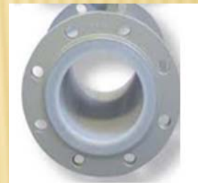
Un-blockable unobstructed flowtube