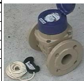
50mm flowmeter and optional '-CP' pulse module.

* to order with mechanical display and pulse output, add the suffix "-CP" to the Order Code.